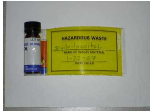
Wrap-around label for Small Containers