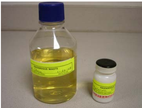
Label on Hazardous Waste Container