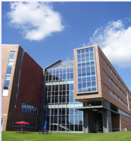
Kansas Life Science Innovation Center

More details: http://publicaccess.nih.gov/