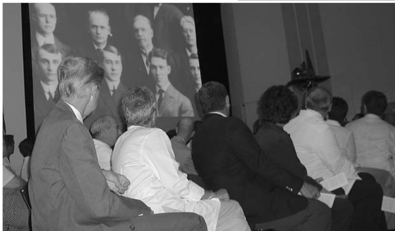
Left, "Pioneers and Visionaries: The First 100 Years," a video presentation that traces the history of the KU School of Medicine, debuted at the White Coat Ceremony.

retain a physician and researcher focused on issues of rural health care in Kansas and the United States. The fund will provide support for a salary stipend, equipment, supplies, graduate student researchers and travel.