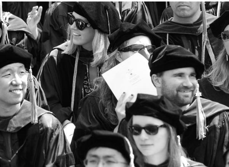
KU School of Medicine grads enjoyed the festivities May 22 in Lawrence.