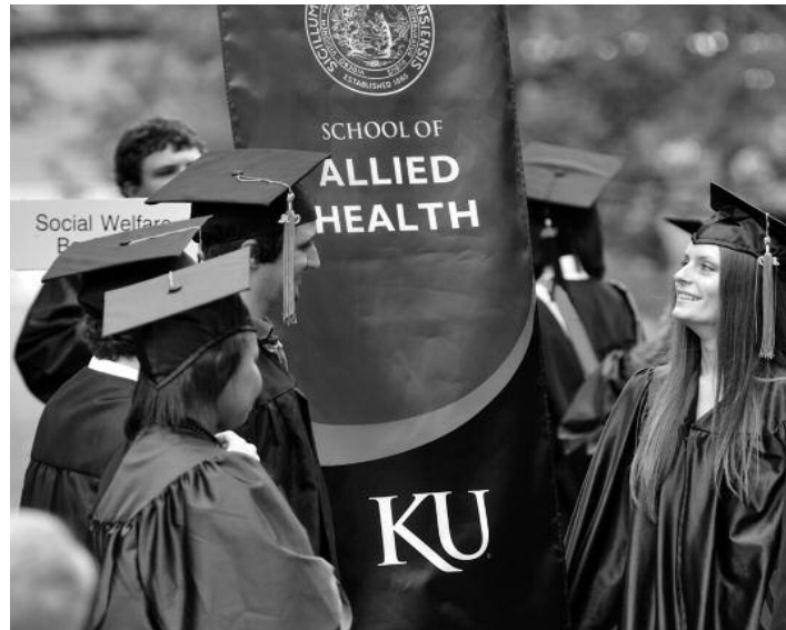
Allied Health grads prepared for the traditional commencement walk down the hill.