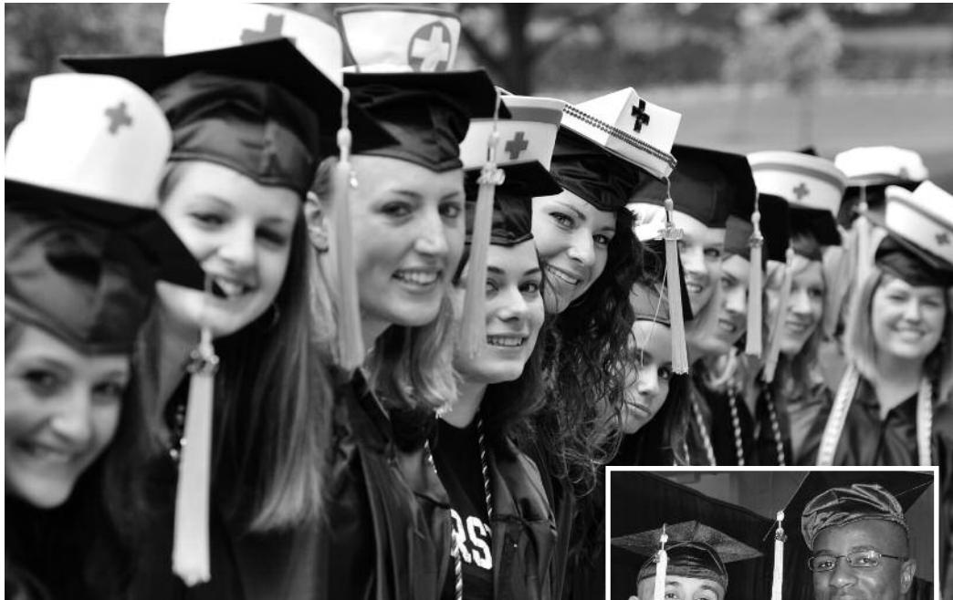
Nodding their hats at tradition, School of Nursing graduates were all smiles on the big day.