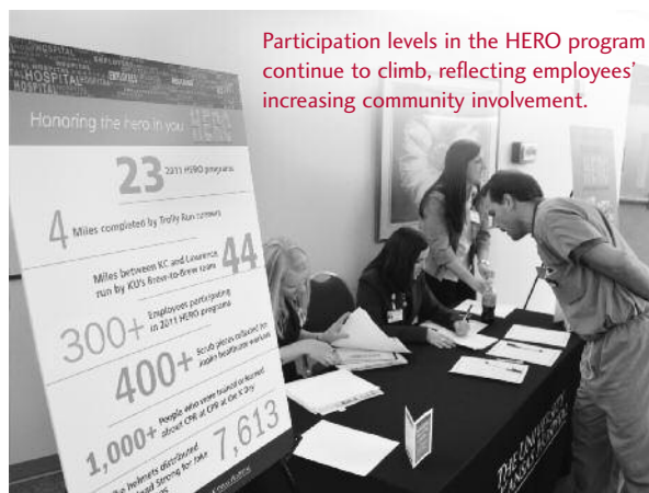
Participation levels in the HERO program continue to climb, reflecting employees' increasing community involvement.

Participation levels have climbed every year since HERO debuted in 2007. The program is a way for the hospital to encourage organized employee involvement